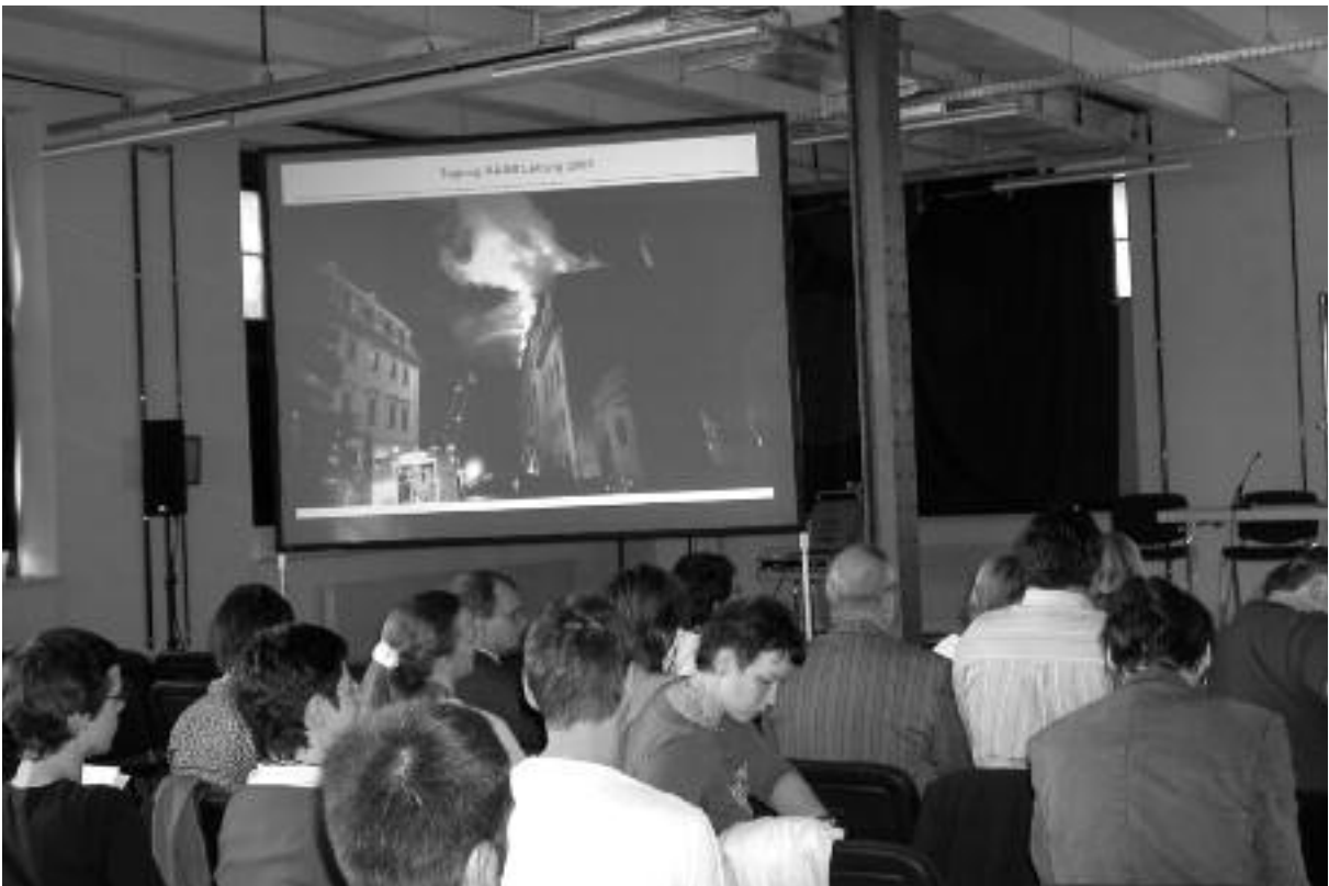
IADA Meeting 2005, Leipzig.

To support the discussions on restoration of the fire and water damaged collection of the Anna Amalia Library in Weimar (HAAB), the IADA organised in cooperation a conference in Leipzig in June 2005. Papers on disasters and their prevention were given during the three day meeting. 180 participants of 13 nationalities discussed the massive problems the HAAB and the library world