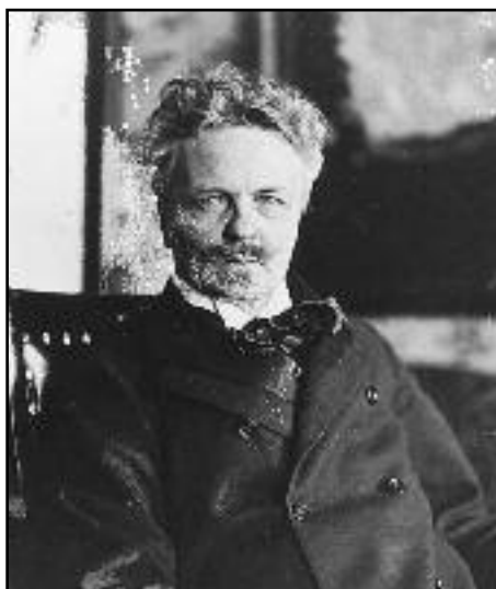
Heat and humidity is an excellent environment for microorganisms as the surface of the negative gives nutrition to the microorganism. The same conditions also activates chemicals residues.