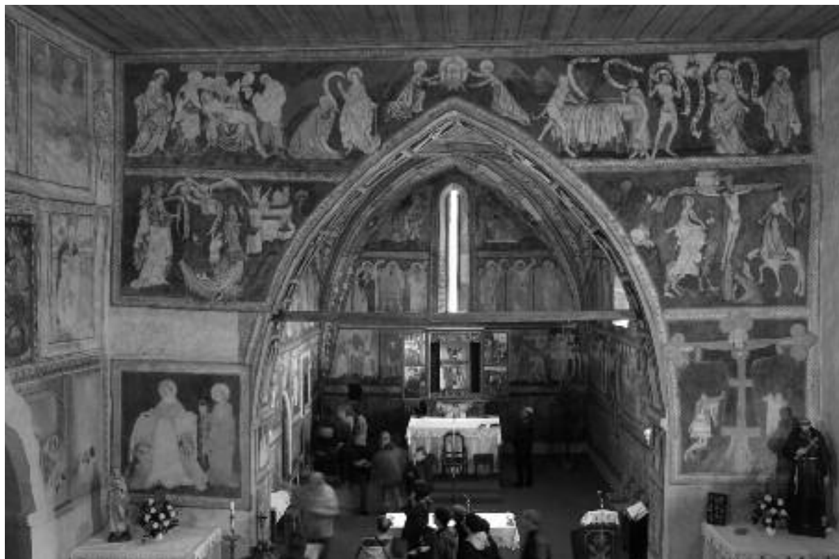
Seminar on Restoration in Bojnice Castle, 2004