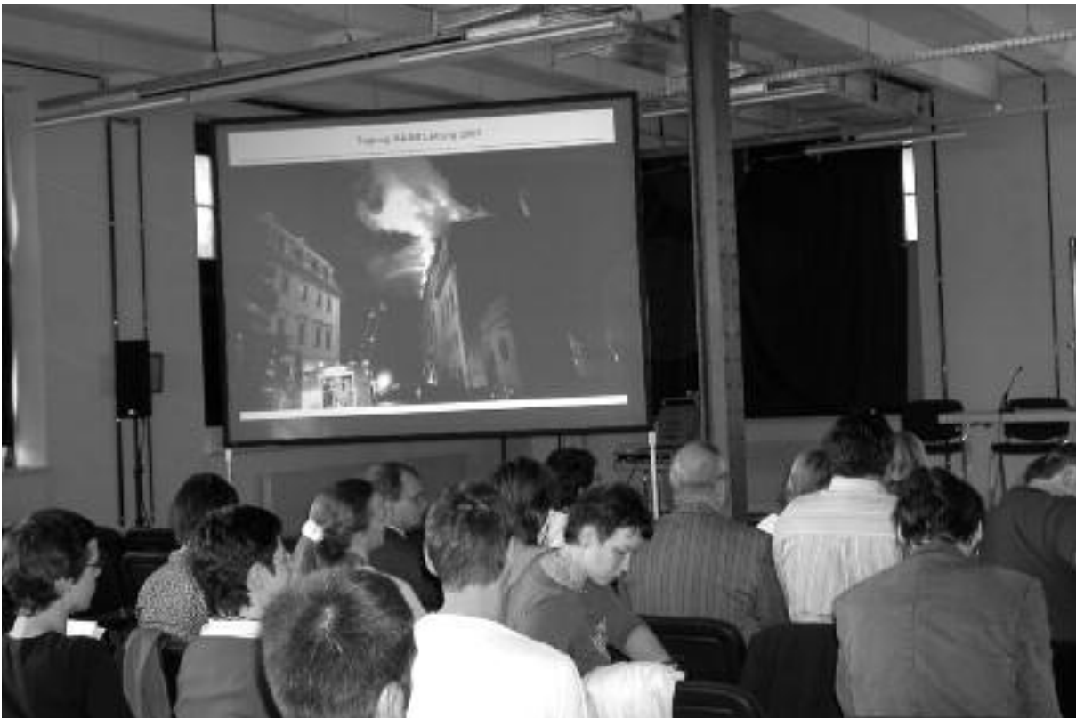
IADA Meeting 2005, Leipzig.

To support the discussions on restoration of the fire and water damaged collection of the Anna Amalia Library in Weimar (HAAB), the IADA organised in cooperation a conference in Leipzig in June 2005. Papers on disasters and their prevention were given during the three day meeting. 180 participants of 13 nationalities discussed the massive problems the HAAB and the library world