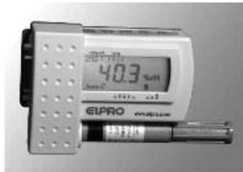
ECOLCG TH1-W with 64.000 readings