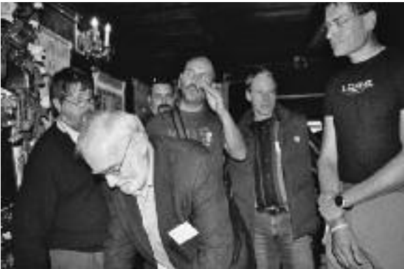
Annual Meeting of Komora Reštaurátorov in Bardejov, Slovak Republic

restorers organisations present at the meeting. It states the interests of all to commonly name the problems of conservation-restoration in the different countries. They supported the intention of a common strategy while imposing the conservator-restorers as a free profession.