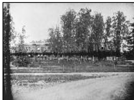
A damaged photo caused by improper storing in a glued pergamyn envelope.

THERE IS A BIG RESPONSABILITY THAT RESTS ON ALL OF US TO CHERISH AND PRESERVE THE INHERITANCE FROM PAST TIMES SO THAT OUR CULTURAL TREASURES WILL NOT BE RUINED BUT KEPT FOR COMING GENERATIONS.