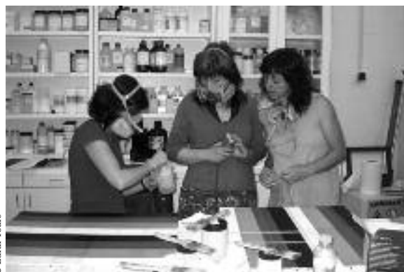
Varnish Workshop at IVAM, Museum of Modern Art Valencia