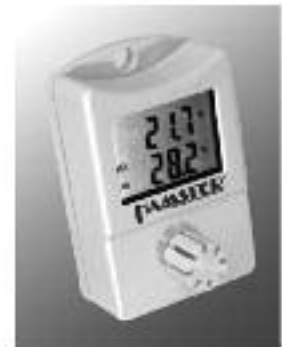
HAMSTER-E EHT1 with 32.000 readings