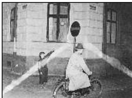
A glued envelope has caused severe damage.