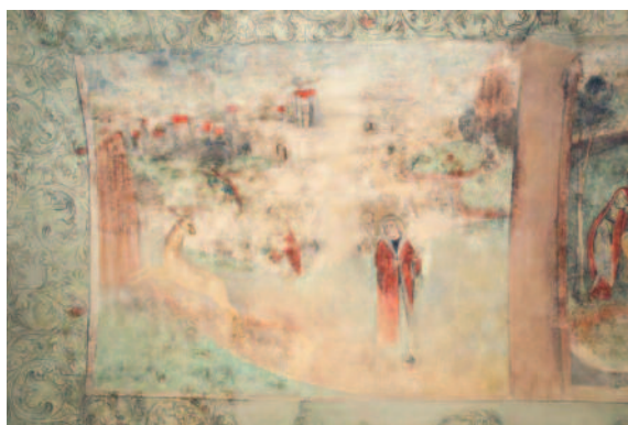
State after retouching (detail of the eastern wall of the Green room)