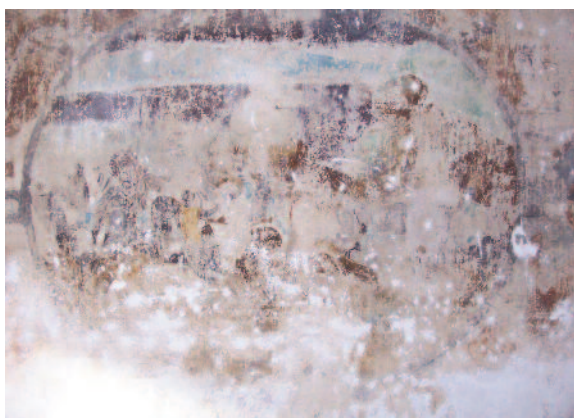
Detail: Cartouche after stabilisation, before retouching