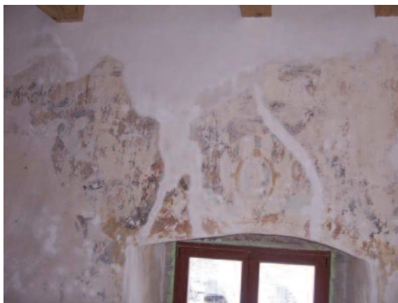
Detail: State after stabilisation, after plastering the losses