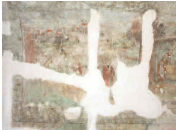
State after plastering the losses (detail of the eastern wall of the Green room)

citing from the category Skills required in the Conservator-Restorer EQF Level 7 Curriculum Principles, (Model curriculum) for the Learning Outcomes – Conservator-Restorer within the ECPL project.