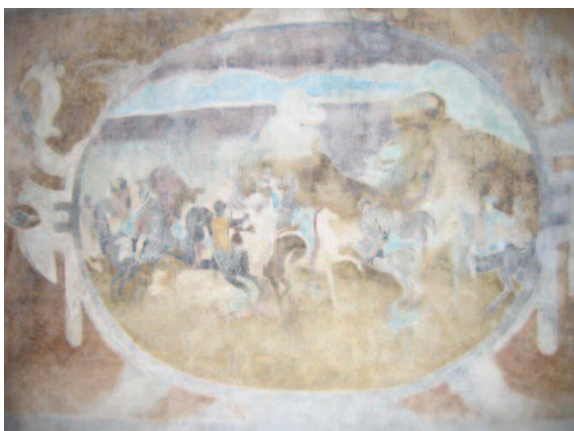
Detail: Cartouche after retouching