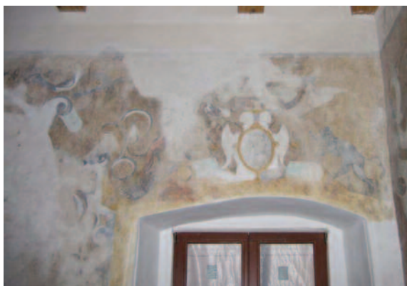
Detail: State after retouching

lovenské múzeum) also to you. This is an example, where it is very obvious, what are the artistic skills, which are required and trained during the restorer's schooling provided at art academies in central Europe (Bratislava, Prague, Budapest ...) and how they can be used in practice. That is why I am not going to describe much about the art-historical background, restoration research and technologies used. An extensive report was published by the KR and Obec reštaurátorov in the Collection of lectures from the 6-th Seminar on restoration in Bardejov 2006 (available on request from the KR office in Bratislava) and the in situ presentation will be published in the 2007 edition of the Collection of lectures (expected in the autumn 2008).