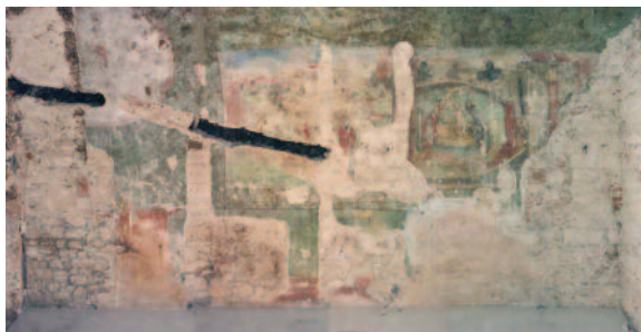
The eastern wall of the Green room of the Thurzo's House in Banská Bystrica – extent of the preserved original decoration