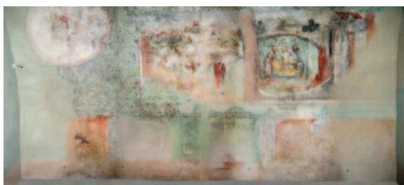
State after retouching (view at the eastern wall of the Green room)

I present to you photographs (with the kind agreement from the authors) where you can see the artistic approach to the heritage. It is a sensitive theme and the decision about the final look is in cases like this is always individual.