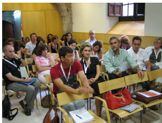
Photo: Attendees of the Barcelona-Montcada meeting, July 21st 2008.