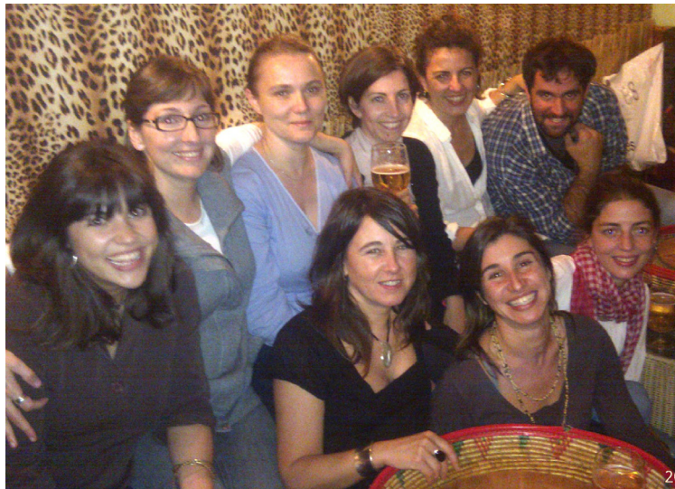
Ill. 4: The new 2010 GT Committee Photo © Pau Maynés