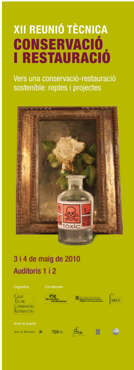
Ill. 1: Poster of the 12th Reunió Tècnica © Alex Masalles