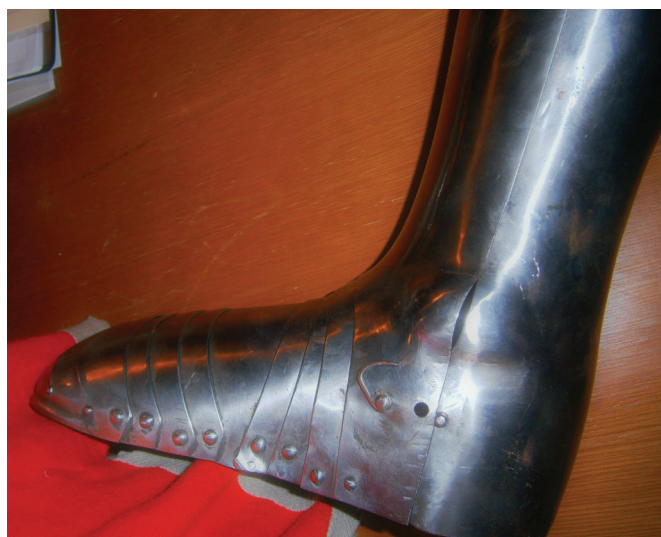
S.Kelly, Conservation of arms and armour