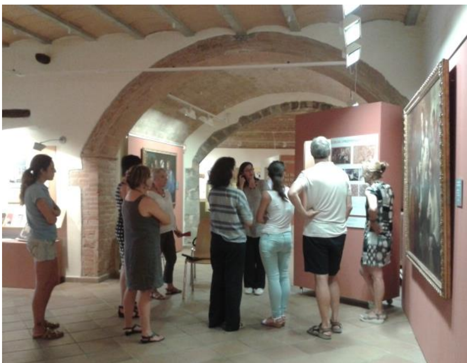
Visit to the exhibition "Technical aspects and materials of the paintings of A.Viladomat" (Premià de Dalt Museum, Barcelona)