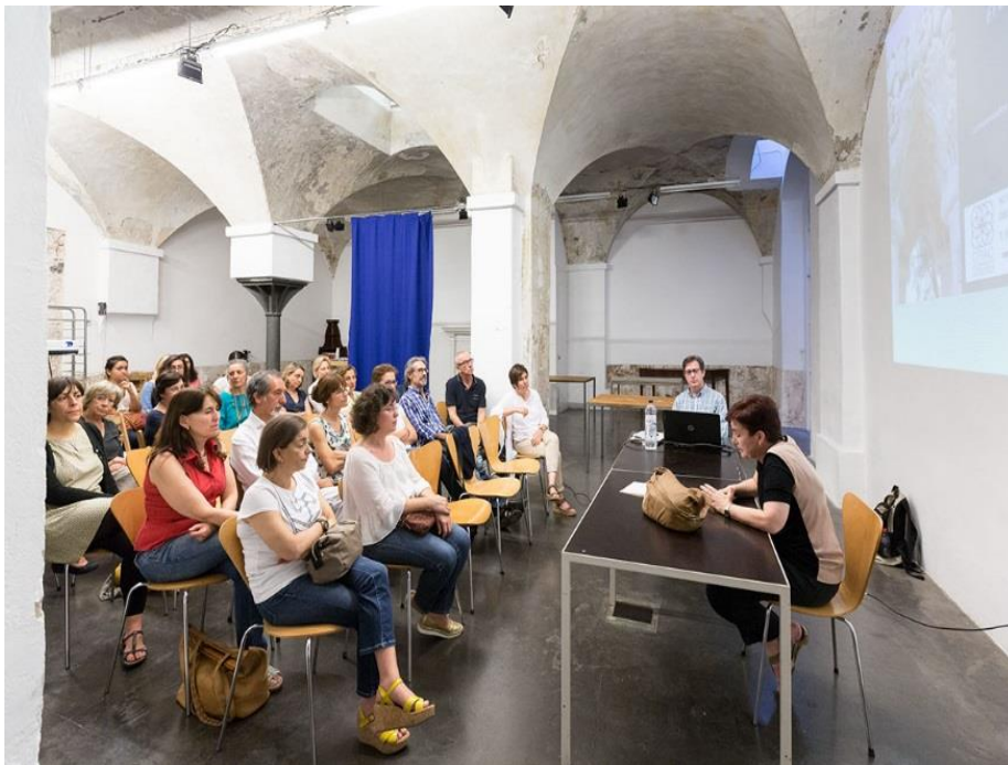
The new office space was inaugurated in June 2015 with a special meeting of the associates and a technical conference El calustro de Palamós visto de cerca. Àlex Masalles. © CRAC