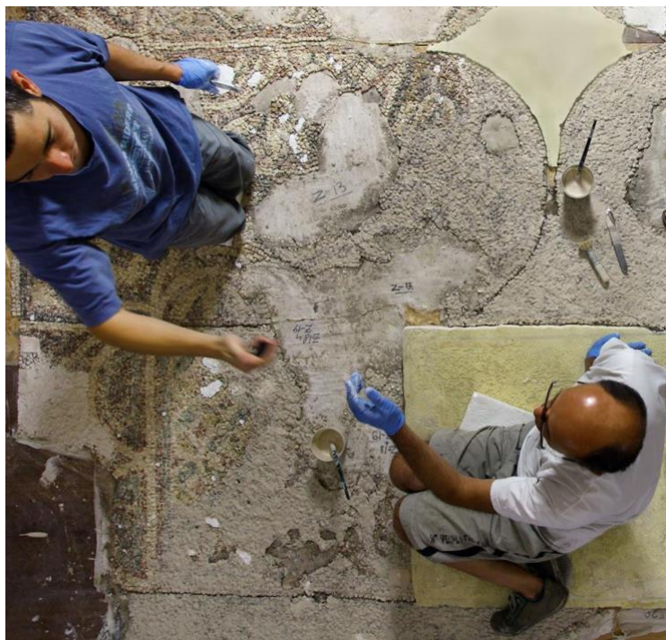
Mosaics from the St Sophia Church in Sofia

In 2015 ACRB continued the project on conservation of the earliest floor mosaics in the church of St Sophia in Sofia, dated second half of fourth century. The department of Conservation at the National Academy of Art in Sofia is partner of the project.