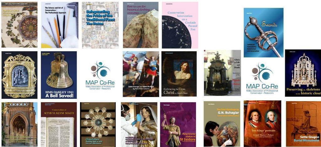
Information gathered by James Licari - Oct 2020

Following the formation of the Voluntary organization, MAPCo-Re, the team always tried to increase outreach programs and social activities, to bring the Conservation Family together, many were fund raising activities, such as BBQs, drinks after work and social parties.