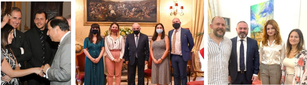
Figure 1: Meeting with Ex-President, Hon. George Abela (5 th June 2009); Meeting with the President of the Republic, Hon. George Vella (2021); Meeting with Minister for, Hon. Owen Bonnici (22 nd Nov 2022)

MALTA ASSOCIATION OF PROFESSIONAL CONSERVATOR-RESTORERS